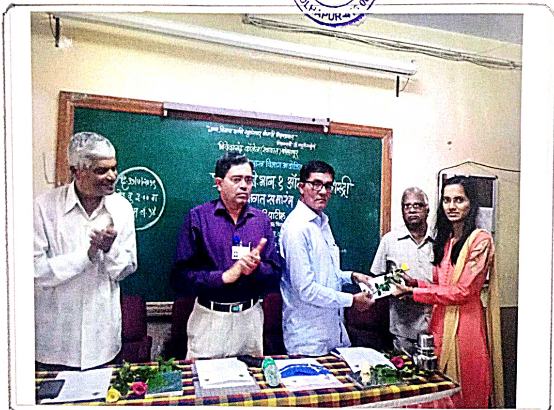
Prize Distribution of Rankers