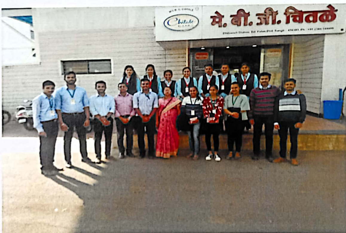
Industrial Visit to Chitale Dairy, Bhilawadi on 17 th Jan, 2019