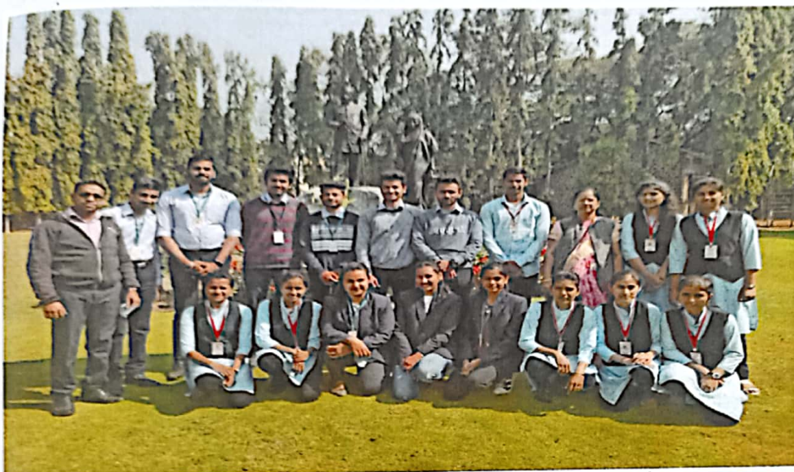
Industrial Visit to Kirloskar Brothers, Kirloskarwadi on 17 th Jan, 2019