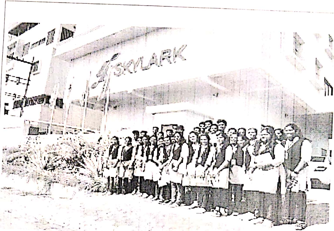
Visit to Skylark Global , Kolhapur