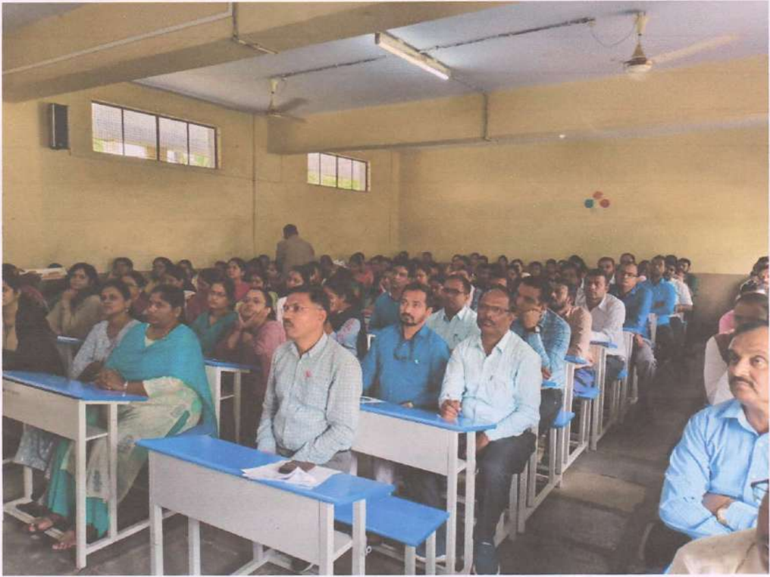
Participants for Orientation Program

X. Signatures of coordinator/ organizer: