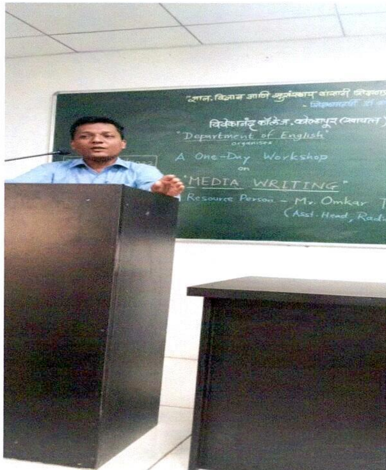
Addressing the students