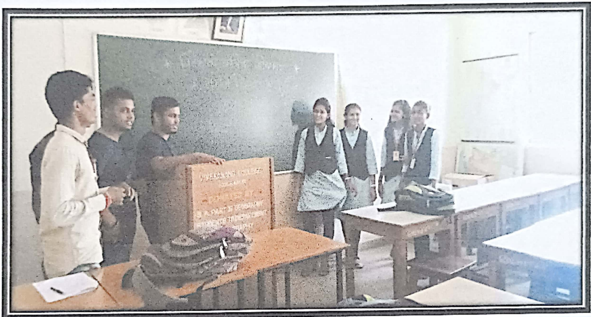
Students Discussion on India- Pakistan Dispute

Debate- India Pakistan Dispute-- 4 February 2019