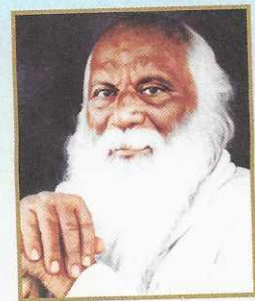
Padmabhushan Dr. Karmaveer Bhaurao Patil D.Lit.