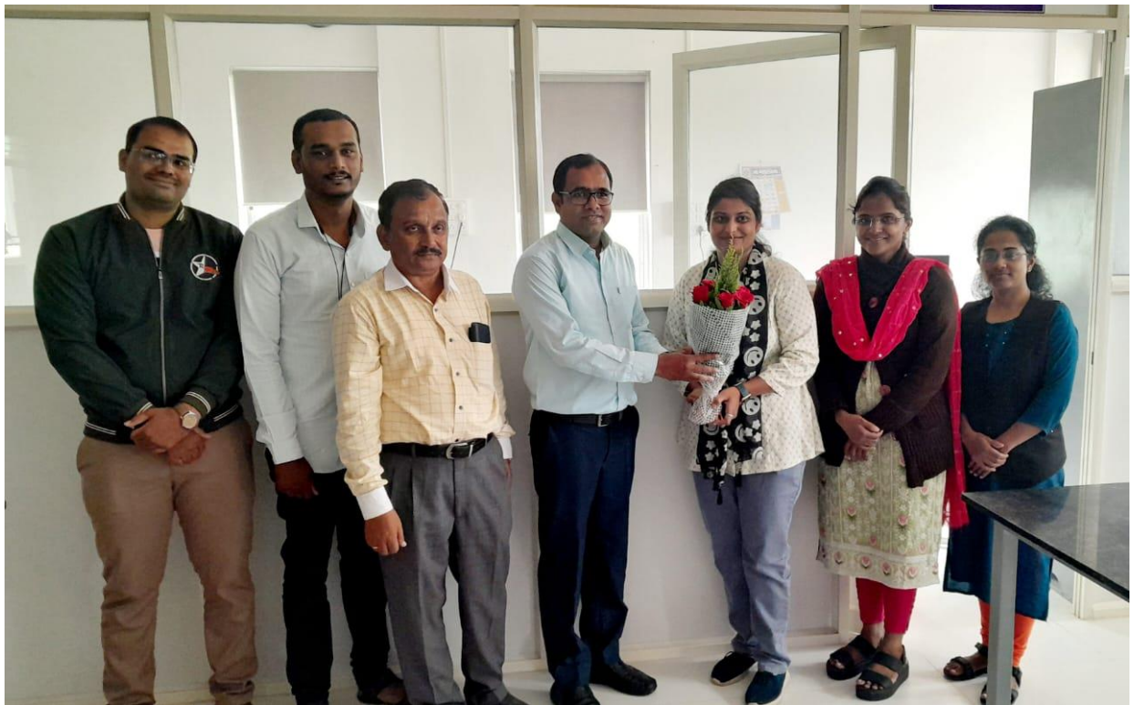
Felicitation by Department of Physics, Vivekanand College, Kolhapur