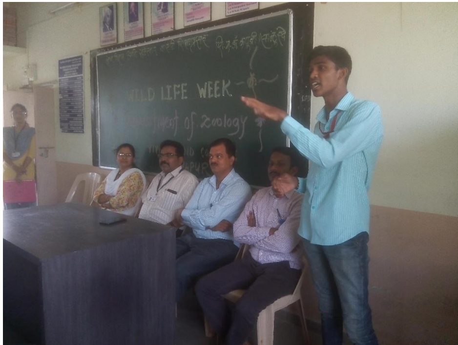
Speech / Elocution