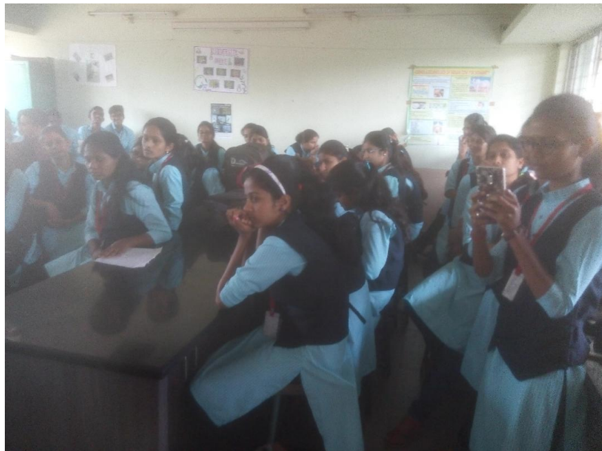
Participant for celebration of wild life week