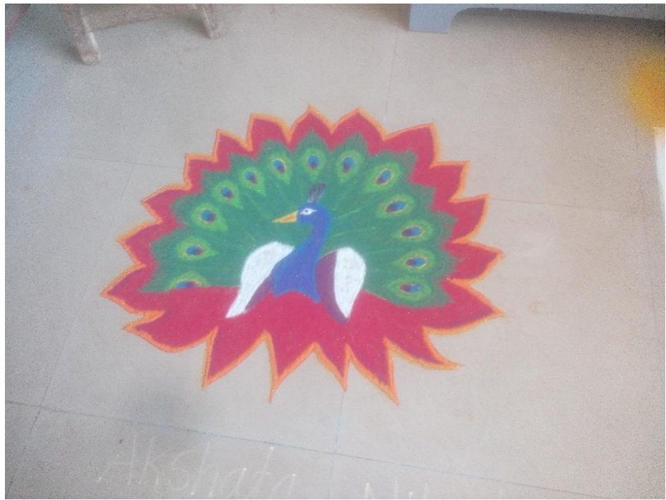
Rangoli on Biodiversity