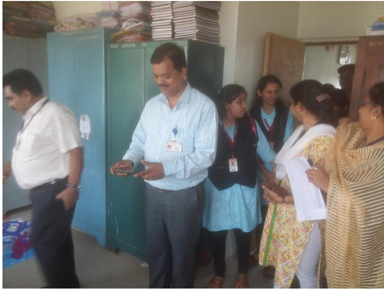
Wild life week observation of Rangoli