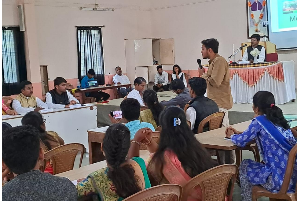
Mock Parliament on 17 th May 2022