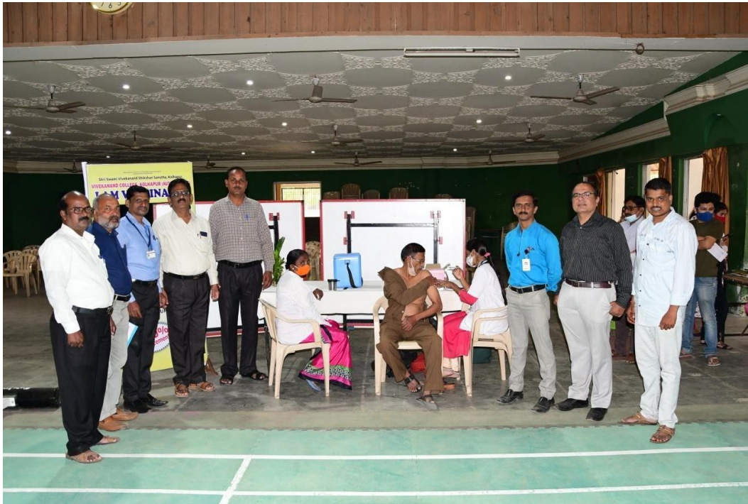
Covishield Vaccination Camp on Oct.27, 2023

In order to assure healthy and secure college campus that will allow to start the college with 100% strength, the college organised a free Covid-19 Vaccination camp for faculty, students, parents and relatives of students. 64 students and their relatives took Covishield vaccine during this camp.