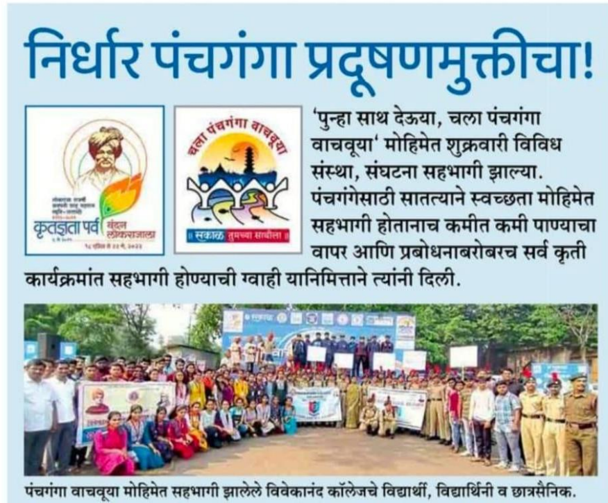
News Paper Cover of Panchaganga Cleanliness Mission on 22 nd April, 2022

A visit to Matoshri Oldage Home at R. K. Nagar in Kolhapur was arranged in order to make students understand the problems of residents in the oldage home. It made our students understand their responsibilities towards the old people in the society. We also arranged a Bhajan and Yoga session for them which helped them to improvise their living conditions.