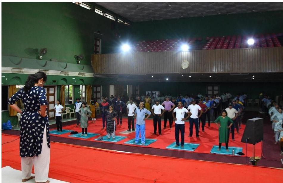
Vivekanandians Doing Asanaz on International Yoga Day 21 st June 2022