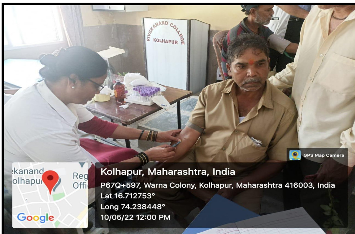
Health check-up of Cleanliness Workers 10 th May 2022

Contribution of cleaning workers, scavengers etc. towards a clean and hygienic society is hardly regarded. Our Sociology department with the help of Dr. D. Y Patil Hospital at Kadamwadi, Kolhapur arranged a health check-up camp for KMC workers. We also provided them counselling regarding physical and mental health. It enabled our students to be sensitive and empathetic towards the workers and appreciate their service.