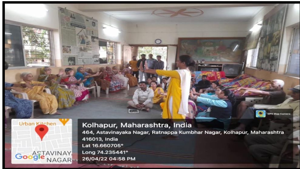
Yoga Session held at Matoshri (26 th April 2022)

A visit to Matoshri Oldage Home at R. K. Nagar in Kolhapur was arranged in order to make students understand the problems of residents in the oldage home. It made our students understand their responsibilities towards the old people in the society. We also arranged a Bhajan and Yoga session for them which helped them to improvise their living conditions.