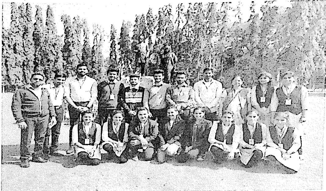
Industrial Visit to Kirloskar Brothers, Kirloskarwadi on 17 th Jan, 2019