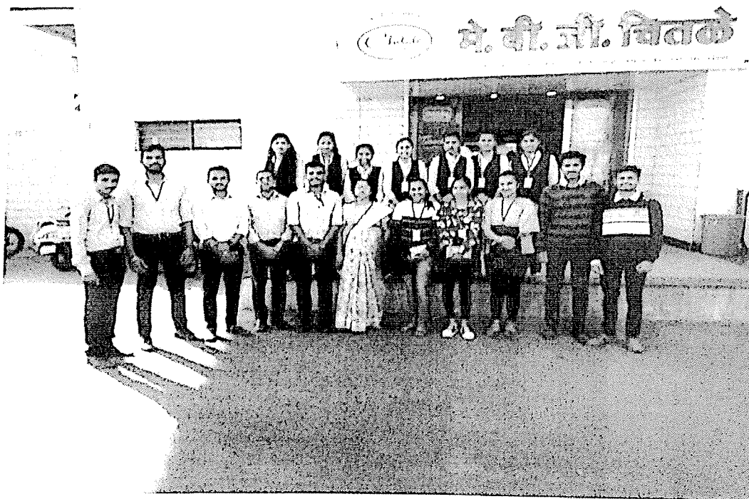
Industrial Visit to Chitale Dairy, Bhilawadi on 17 th Jan, 2019