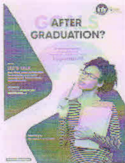
Goals after Graduation.jpeg 239K