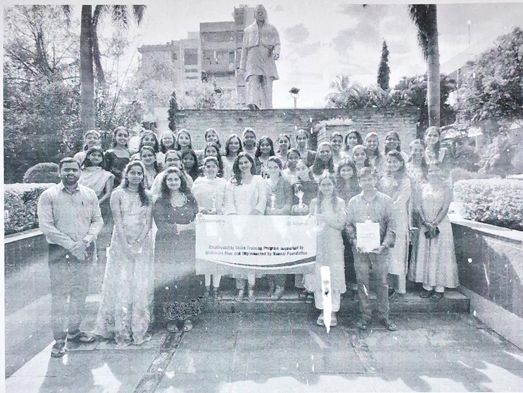
Event of “ Employability Skill training Programme ” For B.Sc.-III Biotechnology Girls