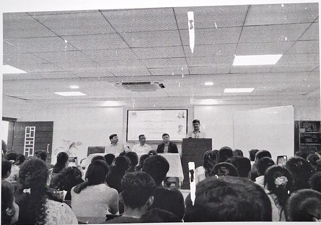
Guest Lecture on " Job opportunities in Clinical Research " organised by Dept of Biotechnology in association with Alchemy Clinical Research services Nagpur