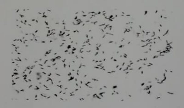
Fig. Gram staining