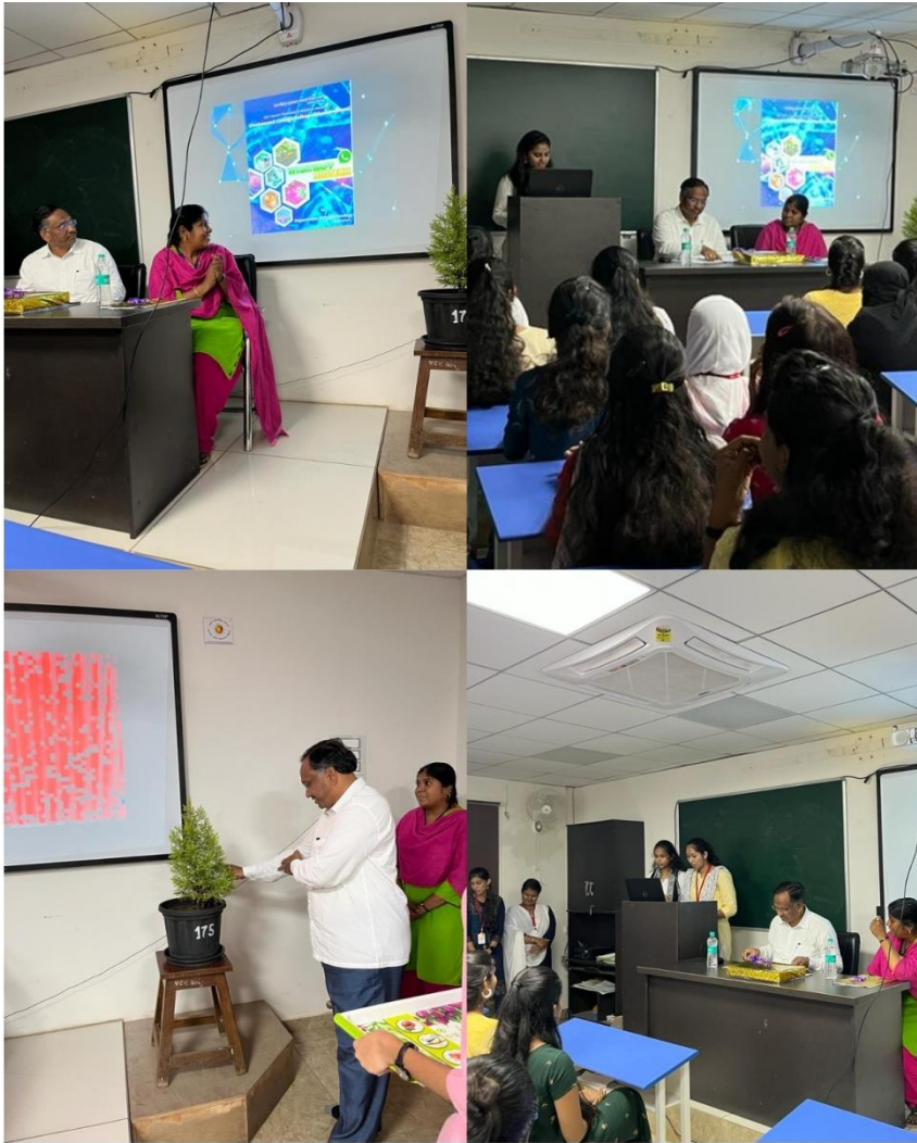
eMagazine Inauguration Activity