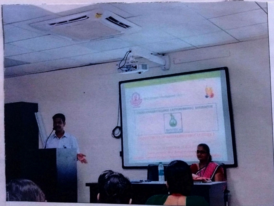
Analysar Kolhapur Forensic lab.