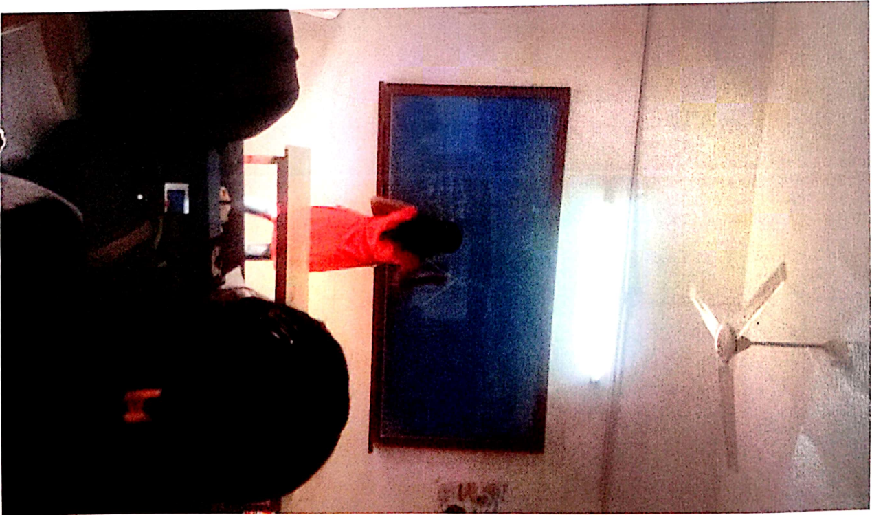
Activity - Seminars by the students of BScII