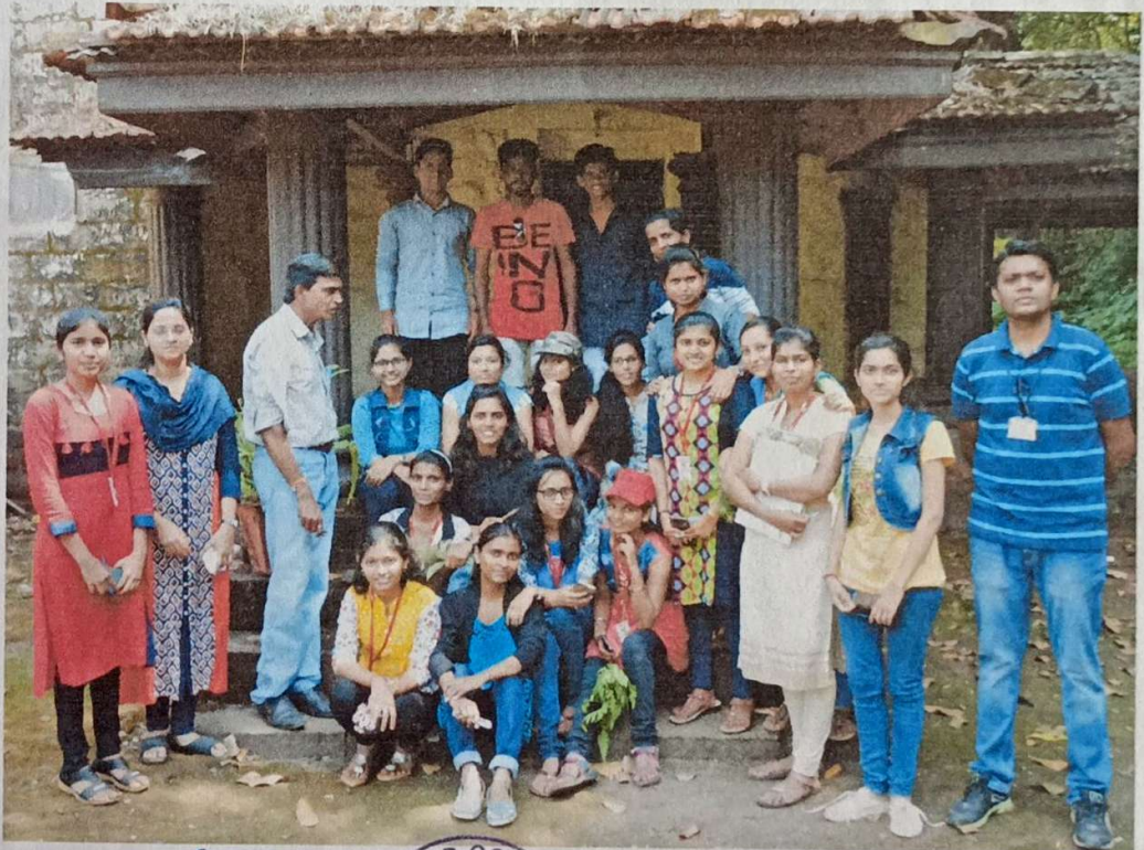
'Students At Gaganbawada'