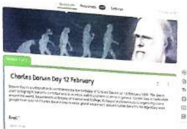
Online Quiz form of 'Charles Darwin Day'