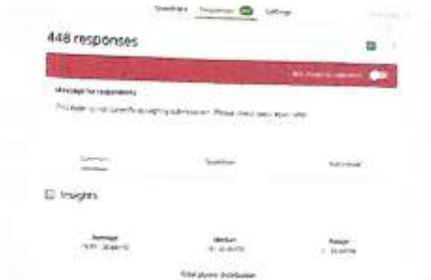
Responses of online quiz