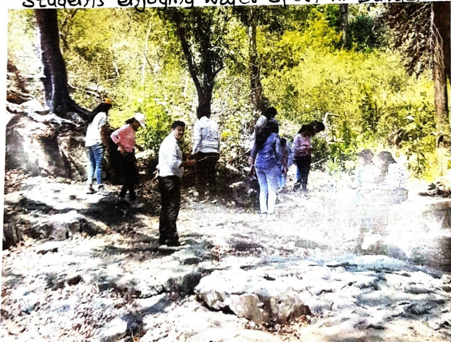
Students recorded flora in Dandeli forest