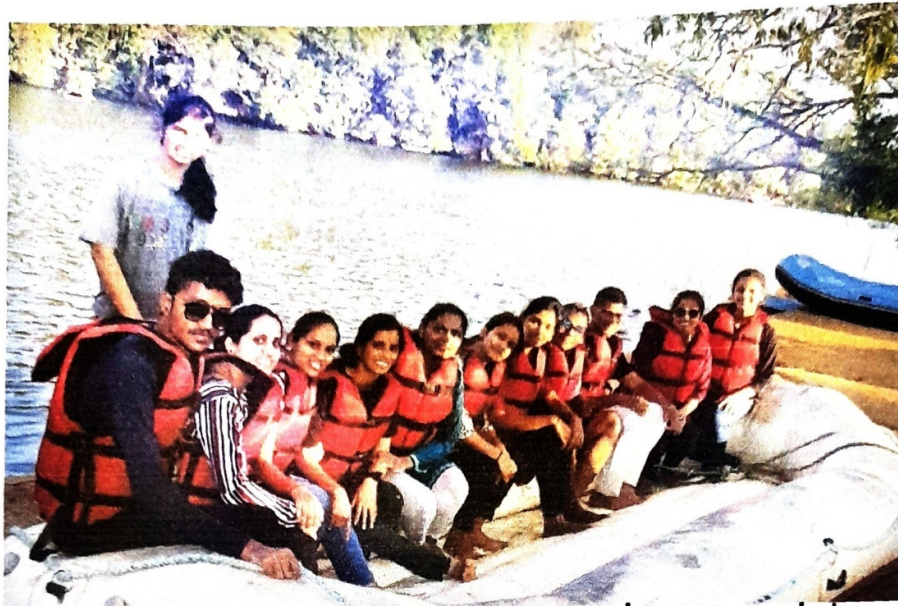
Students enjoying water sport in Dandeli