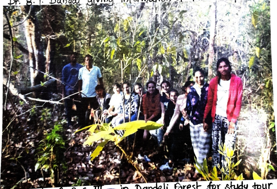
Students of B.Sc.III in Dandeli forest for study tour