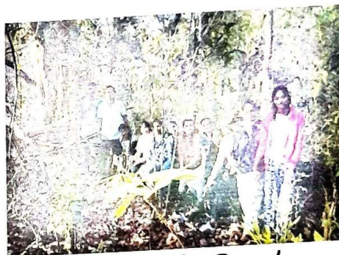
B. Sc. III students observing flora of Dandeli forest

10. Signatures of coordinator/ organizer: