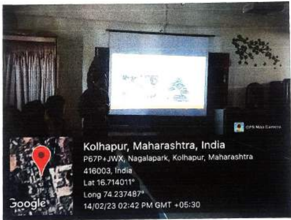
B.Sc. III Student Ashitosh Gharage giving presentation o 'Ornamental Plants'