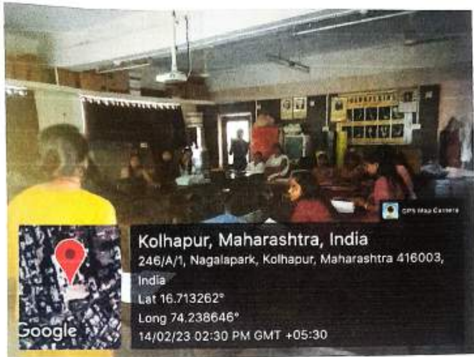
Seminar Presentation of B.Sc. III Students in Department of Botany