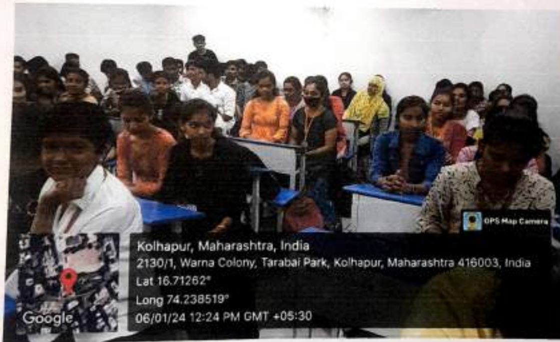
Students attended the guest lecture on "Role of institute in biodiversity conservation"