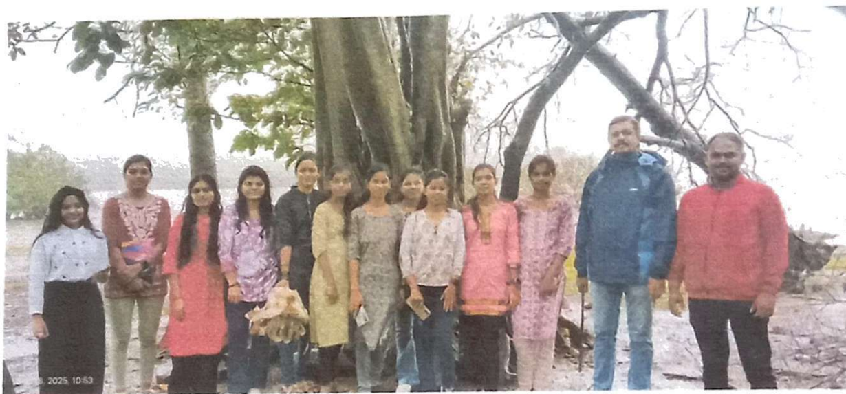
B.Sc. III and B.Sc. II (Major) students visited Kode Dam