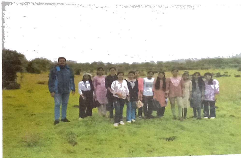
B.Sc. III and B.Sc. II (Major) students visited Morjai Plateau