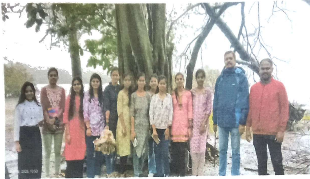
B.Sc. III and B.Sc. II (Major) students visited Kode Dam