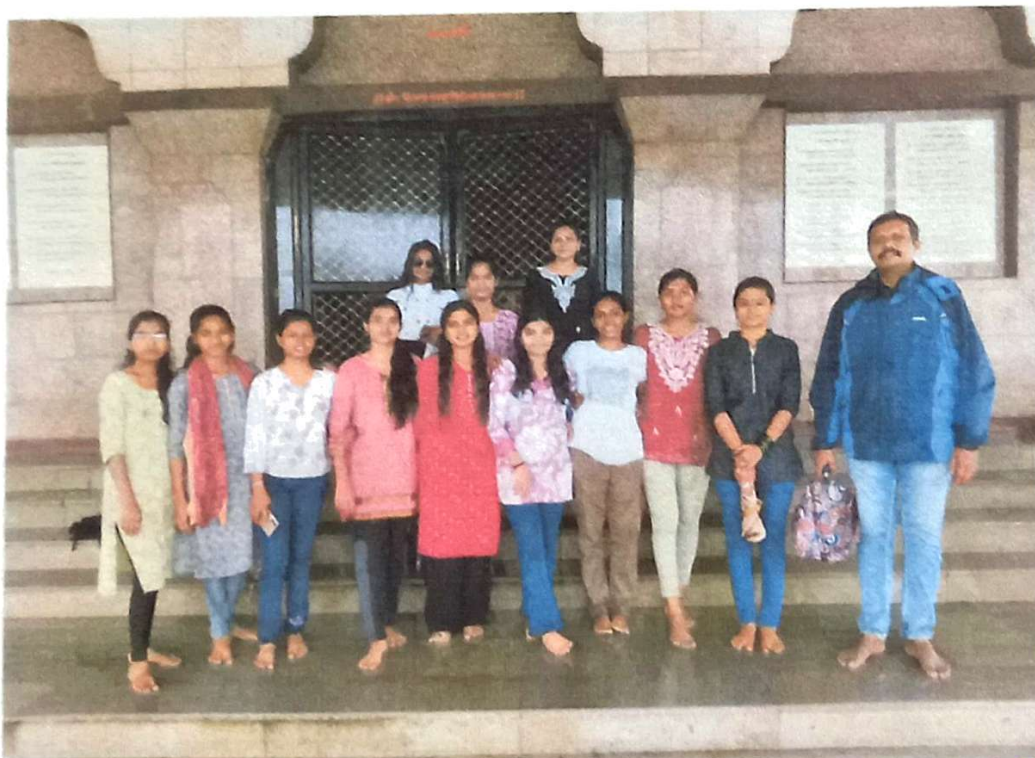
B.Sc. III and B.Sc. II (Major) students visited Gagangiri Maharaj Temple