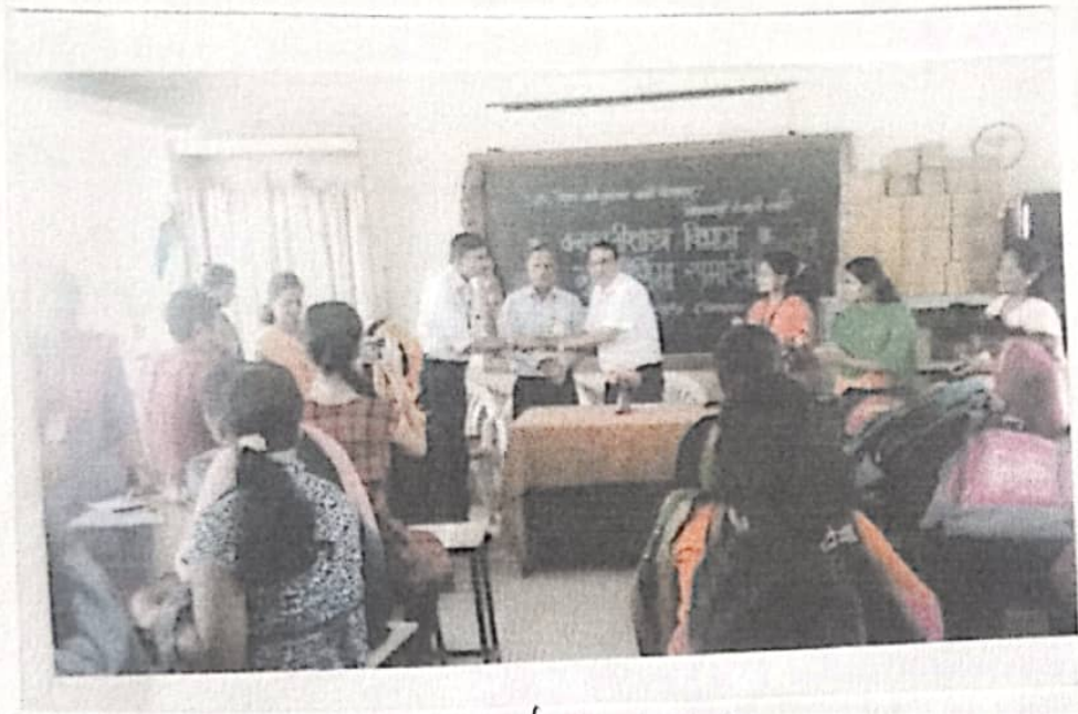
Felicitation of Guest