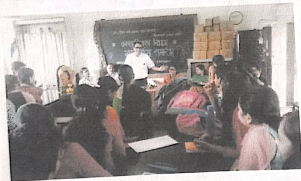
Speech of Guest