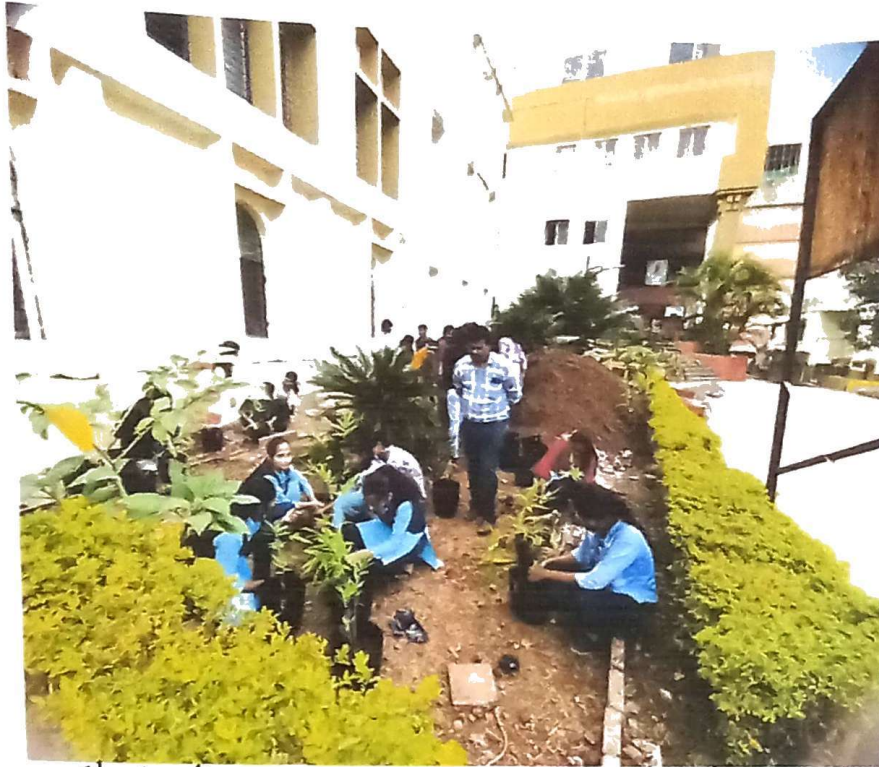
Students preparing for the plantation drive