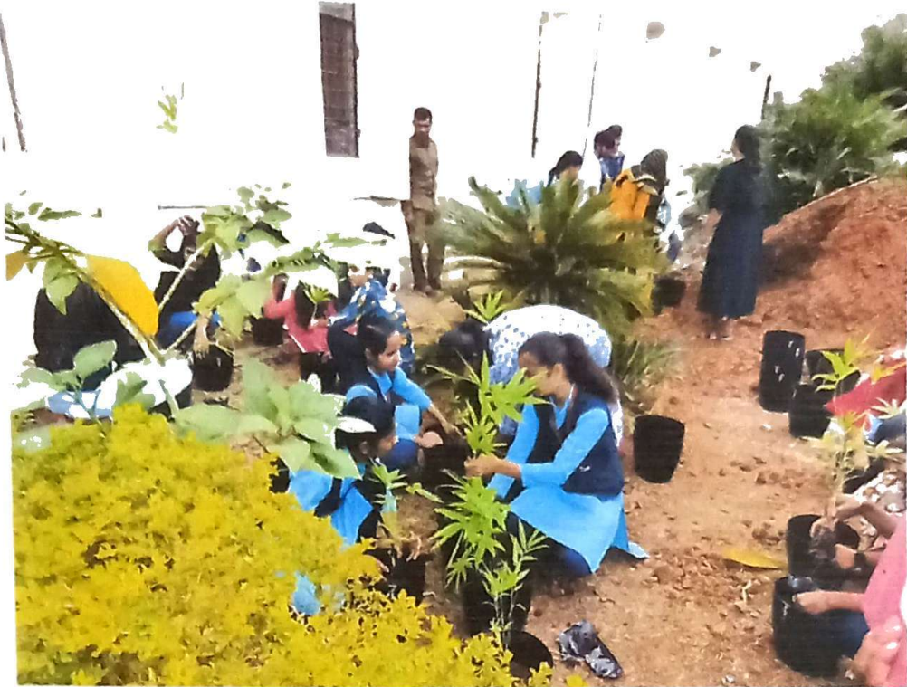
Students preparing for plantation drive.