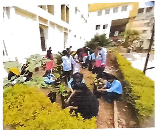
Students preparing for the plantation drive.