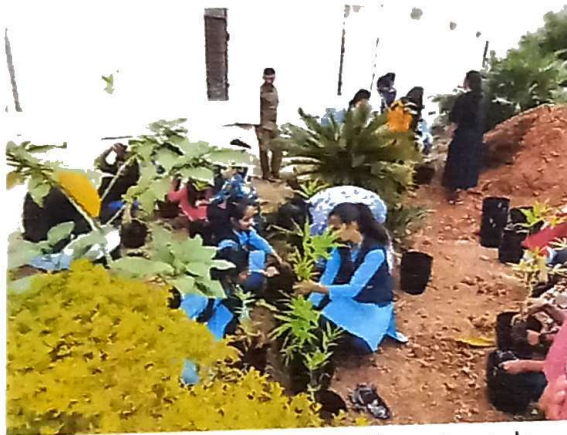
Students preparing for the plantation drive