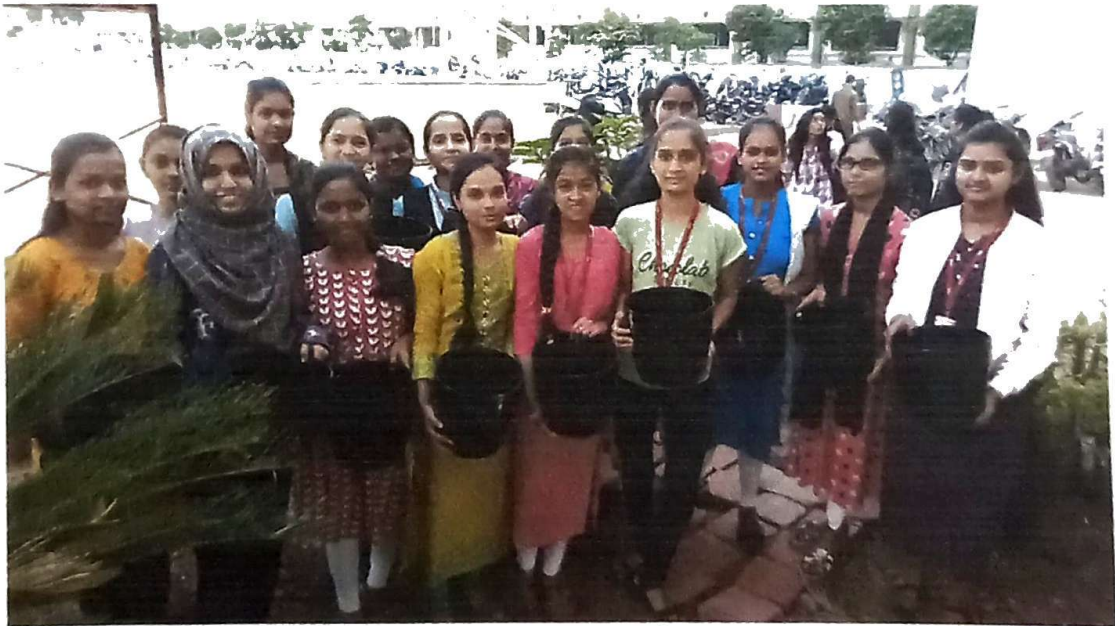
Students' overwhelming response for plantation.