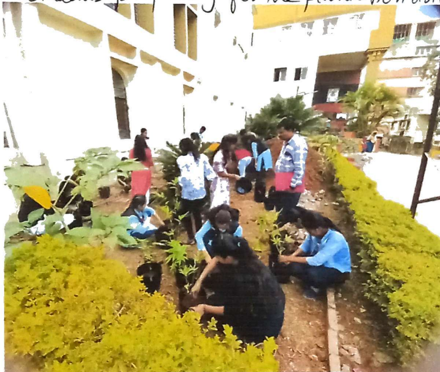
Students preparing for the plantation drive