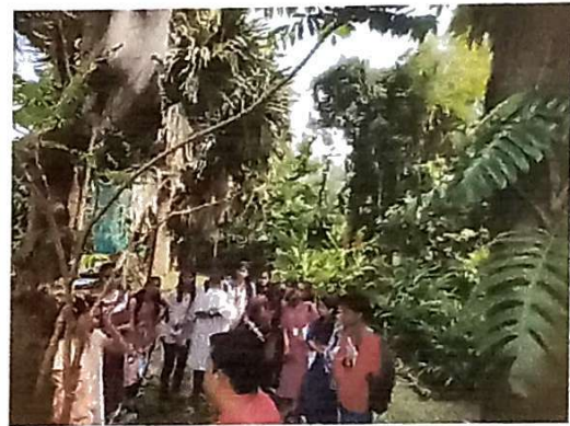
Students observing plants in Lead Botanical Garden, SUR