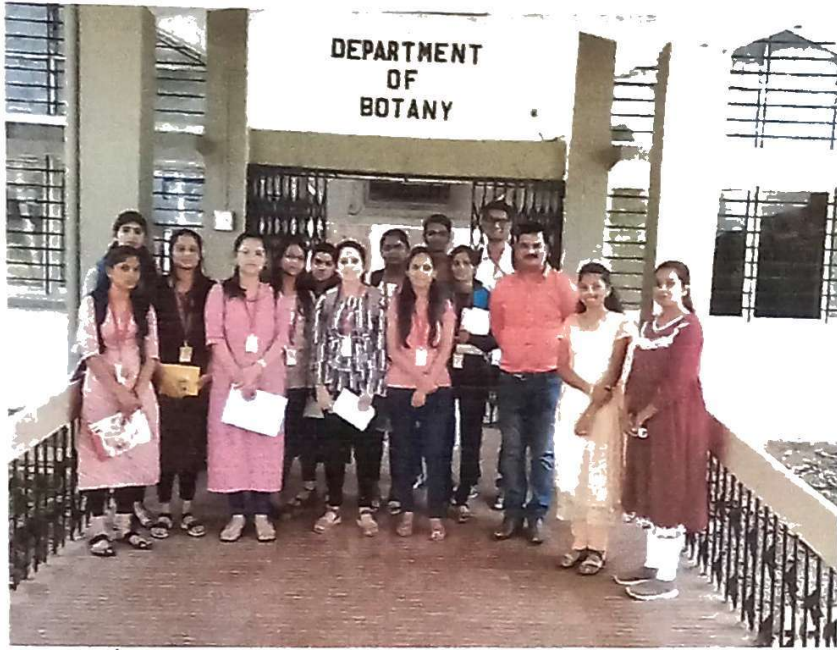
Students of B. Sc. III at Department of Botany, Shivaji University, Kolhapur.