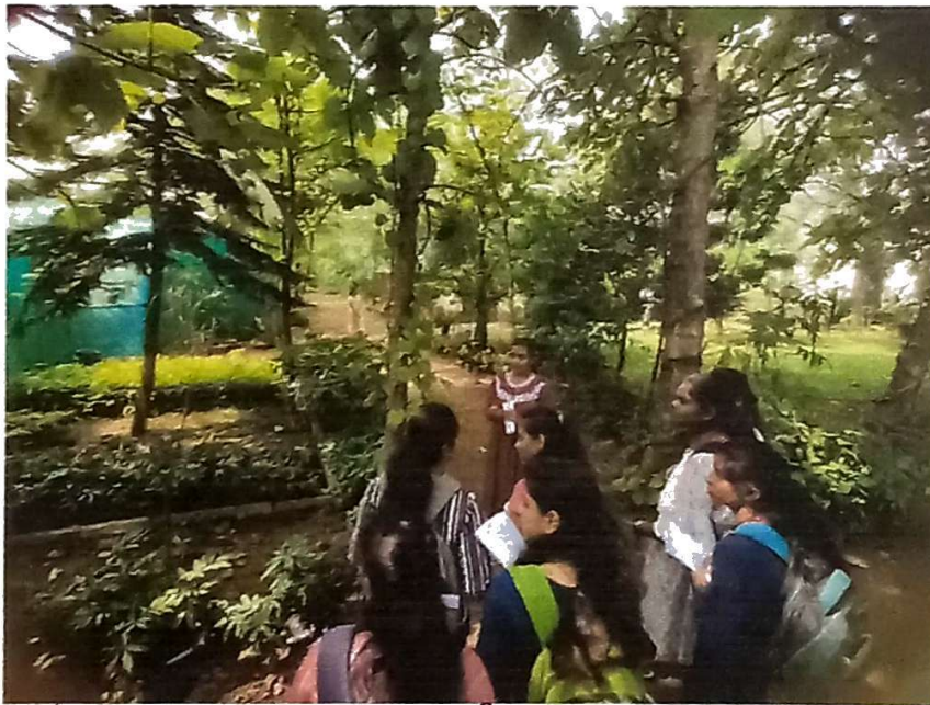
Students collecting information of plants in Botanical Garden, SUK.