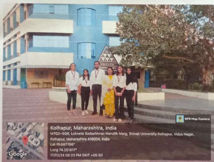
Students attended "Green College Clean College Competition" at CSIBER College, Kolhapur.