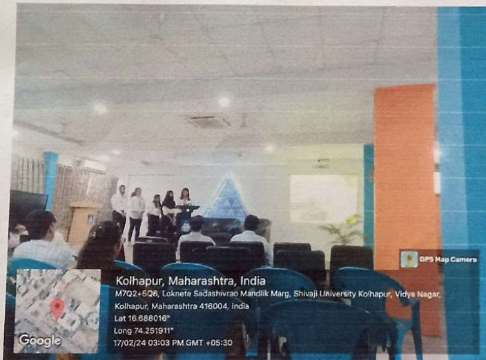
Presentation by students on Green initiatives in college campus