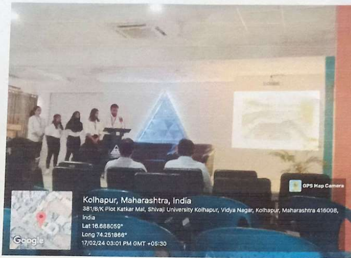
B. Sc. Students showing their presentation