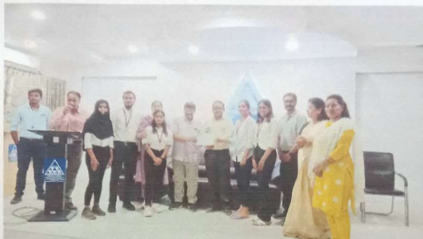
Certificate distribution at the event.