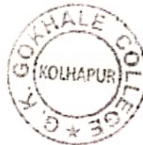
Principal, G. K. G. College, Kolhapur.