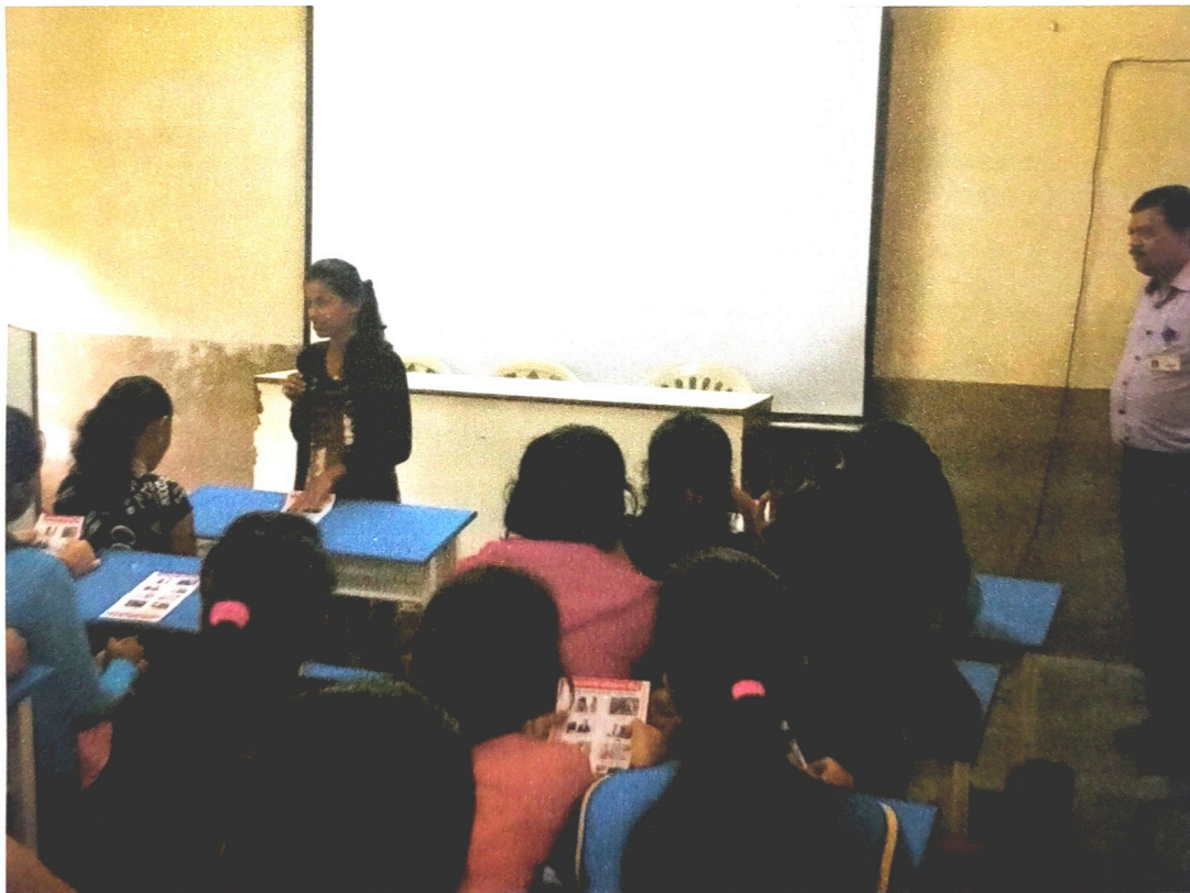
Photo 2: Faculty of i-net solution are addressing about the UMANG App to students during the Programme.