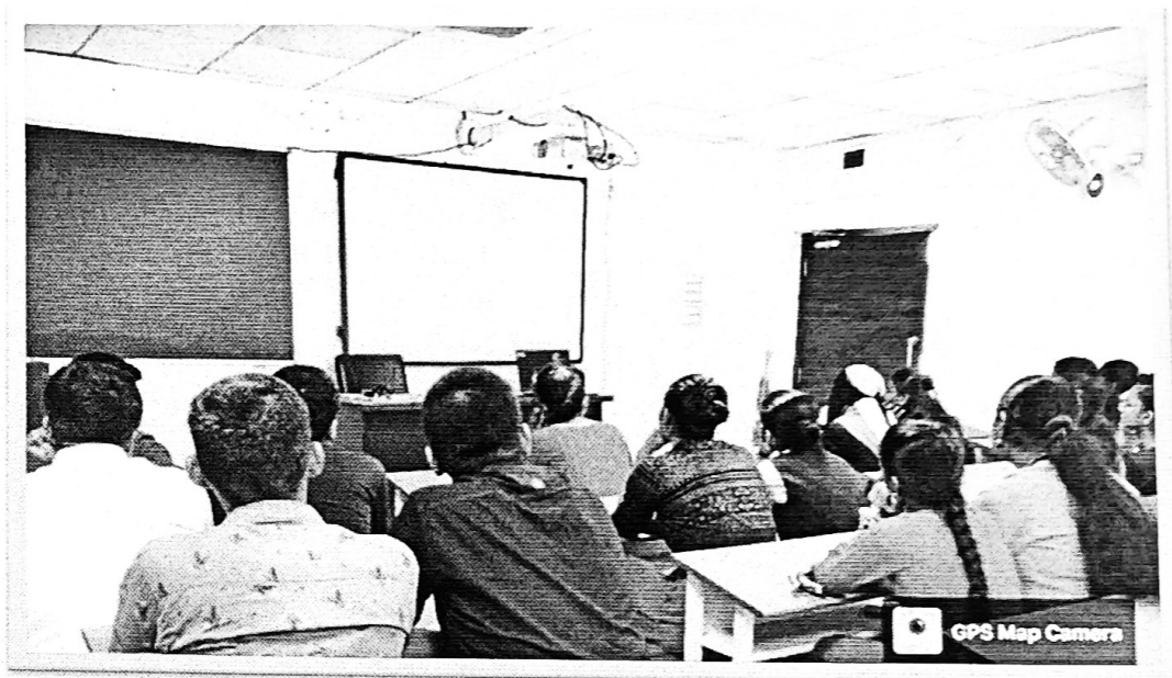
Figure 1 Film Screening of A Doll's House