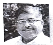
Hon. Chandrakant Dada Patil President