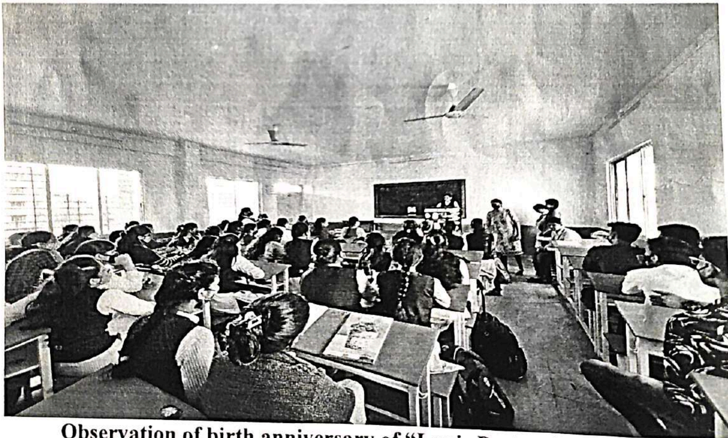
Observation of birth anniversary of "Louis Pasteur" 2021-2022