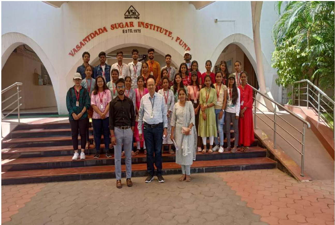
Visit to VSI, Pune