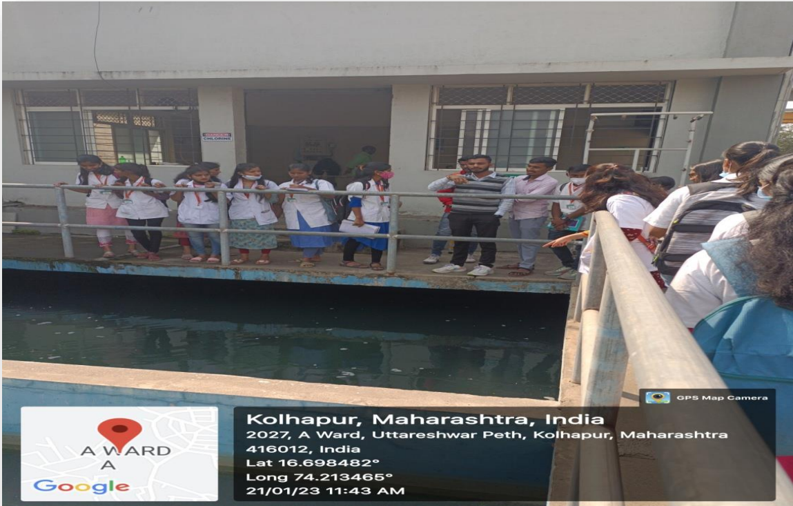
B.Sc.III Study tour at STP MLD sewage treatment plant, Dudhali