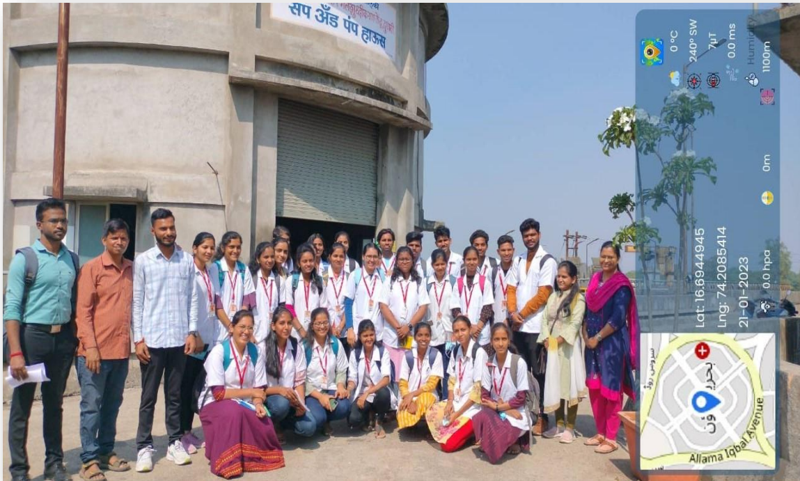
B.Sc.III Study tour at STP MLD sewage treatment plant, Dudhali (21-01-2023)