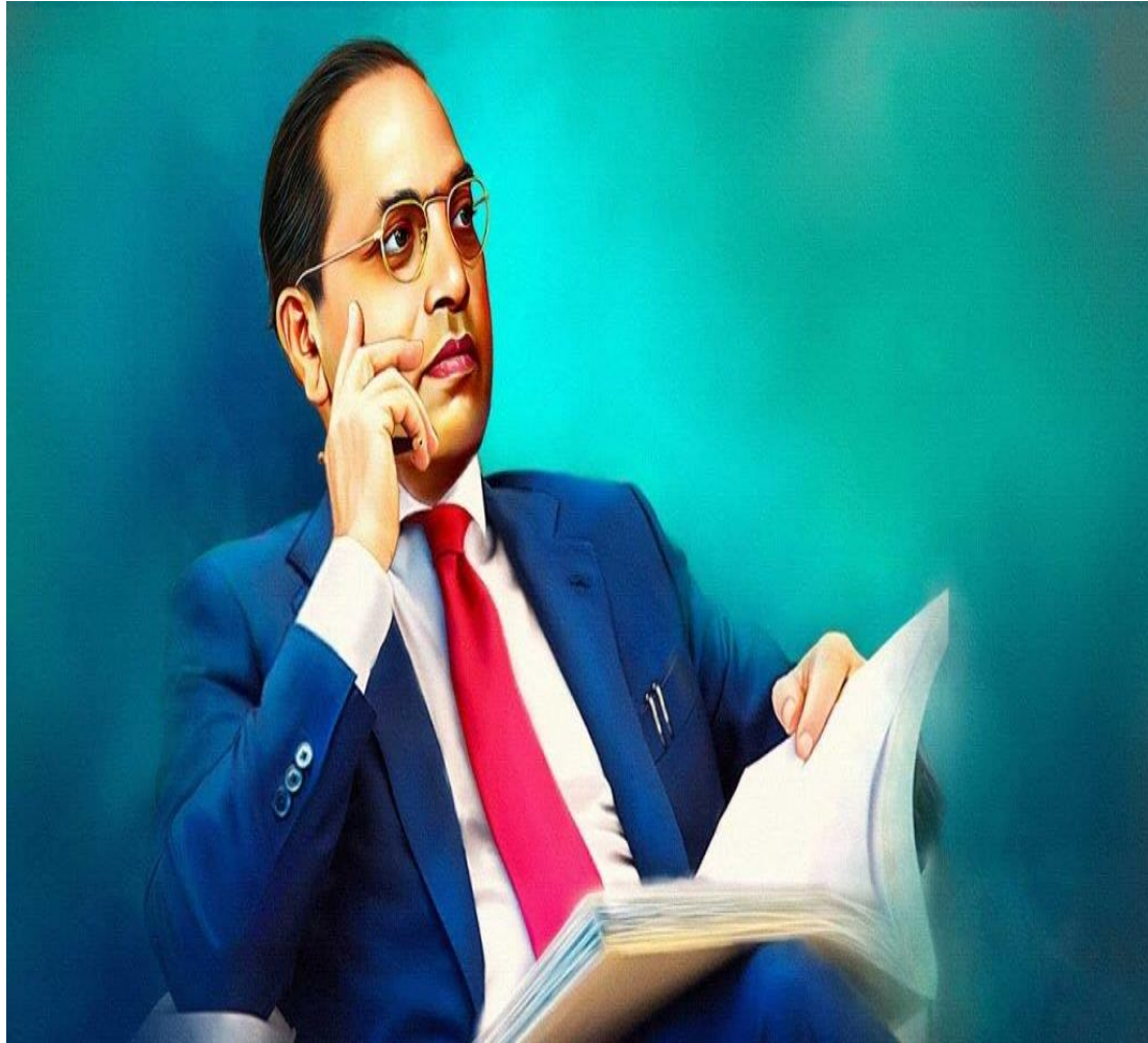
Dr. B.R. Ambedkar (1891-1956)