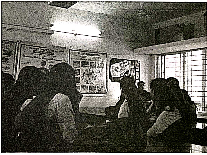
Wall paper and Poster Presentation on wild life week

[Signature] Head Department of Zoology Vivekanand College, Kolhapur