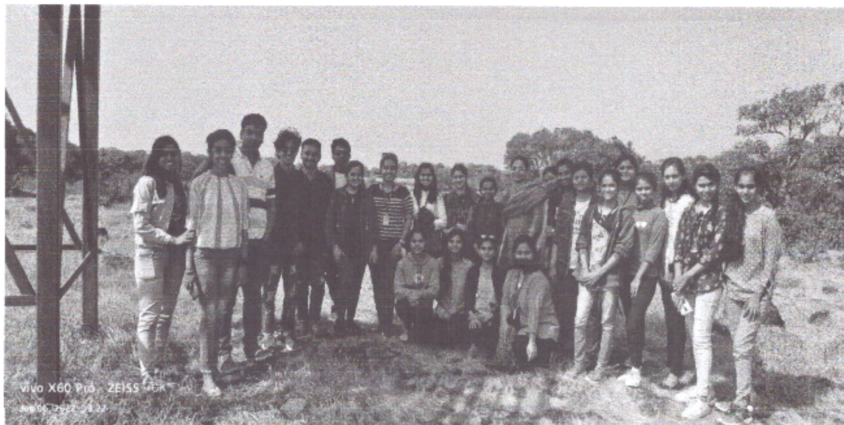
Photo: B. Sc. III students at Laxmi lake, Dajipur Wildlife sanctuary.