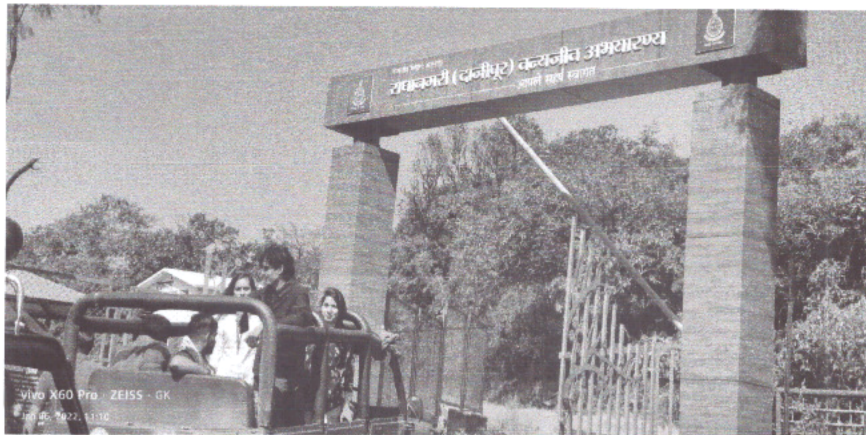
Photo: B. Sc. III students in Dajipur wild life sanctuary to start jungle safari