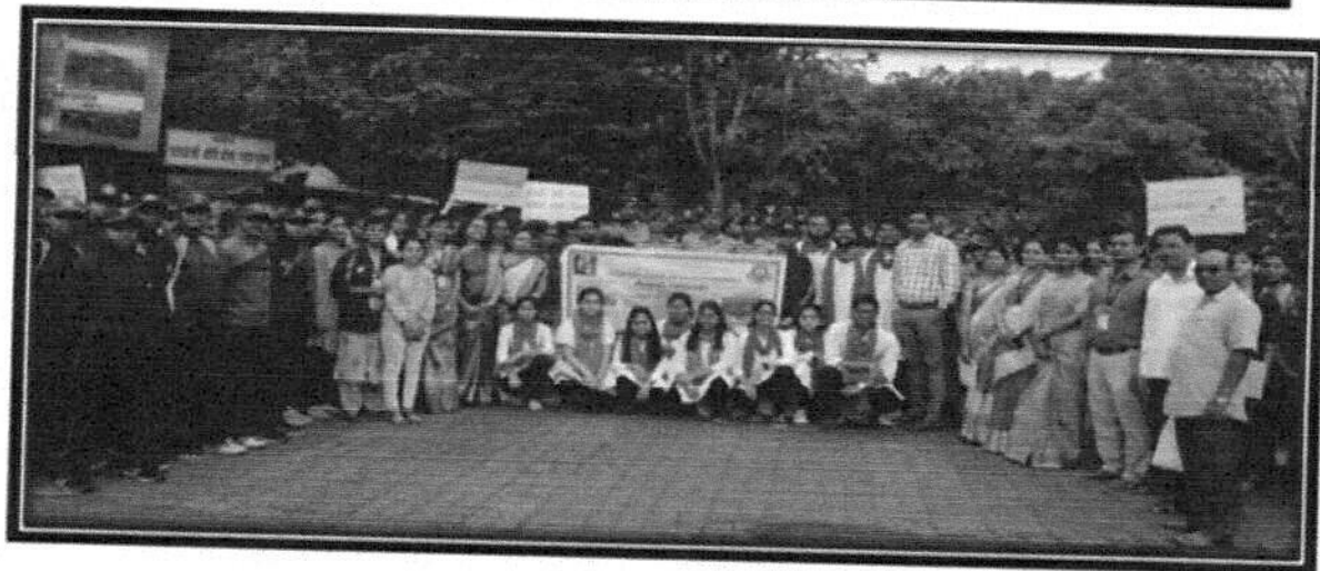
Figure: 1-6 Rally: Awareness for conservation of Wildlife