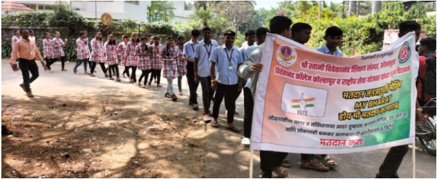
Active and enthusiastic students rallying for the voter’s awareness campaign.

Kolhapur, Nov 16: On Saturday, Vivekanand College conducted a voter awareness rally aimed at educating citizens about the importance of voting under the theme “My Vote, My Right” & encouraging the performance of their civic duty. The rally proceeded from Vivekanand College to Nagla Park, Tarabai Park, Zilla Parishad Road, and back to the college campus.