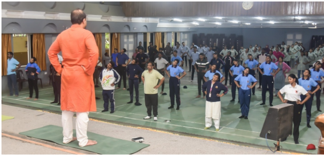
Teachers & Students practicing Yoga at Smriti Bhavan

International Yoga Day celebrated with enthusiasm at VCK