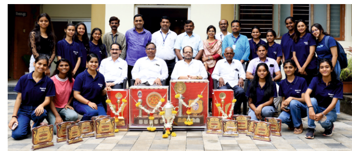
Students and teachers with all the trophies won at Youth Festival

Kolhapur, VCK won 16 prizes in different art categories and secured the General Championship at the 44th Youth Festival of Shivaji University, held at Ajara Mahavidyalaya, Ajara.