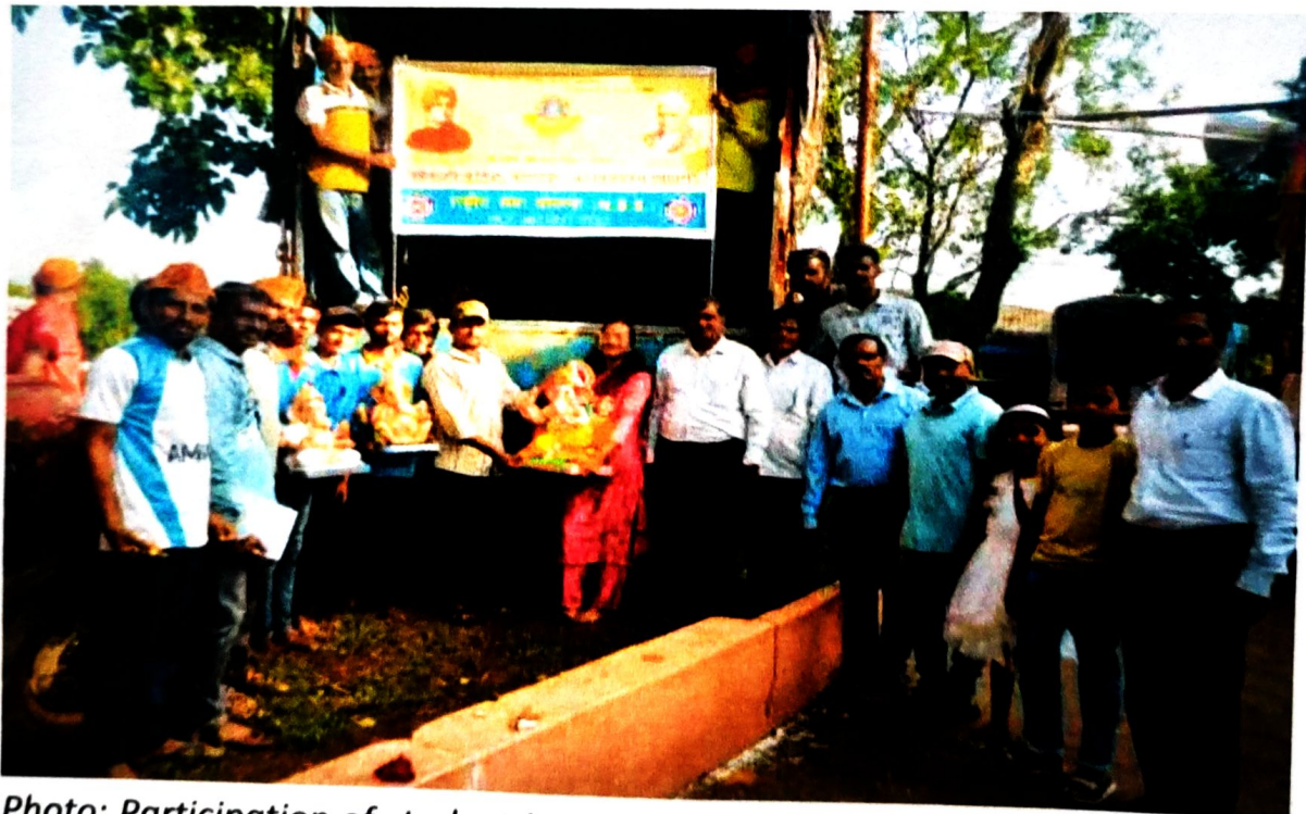
Photo: Participation of student in Ecofriendly Immersion and Disintegration of Ganesh Idols activity.

9. Signatures of coordinator/ organizer: