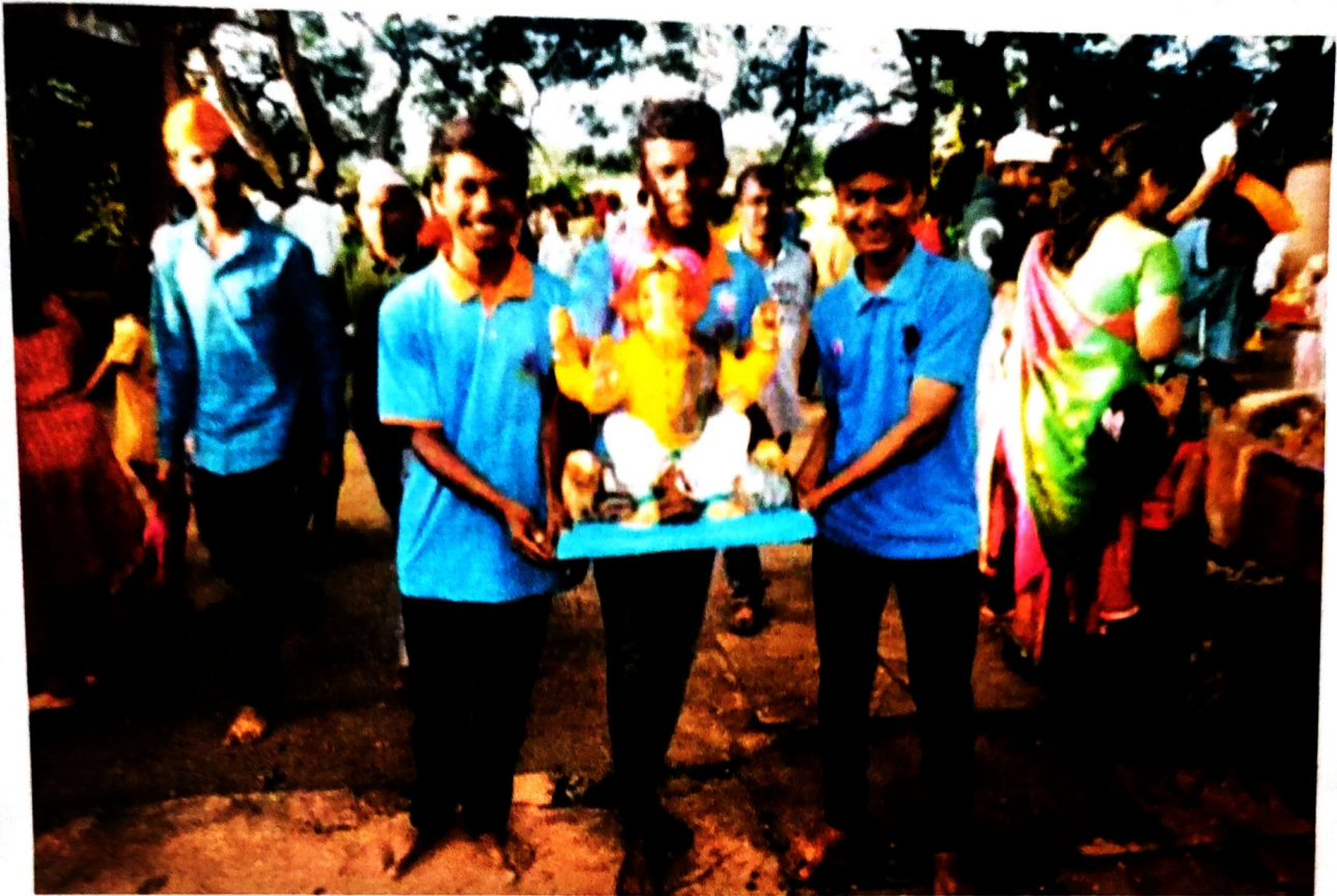
Photo: Participation of student in Ecofriendly Immersion and Disintegration of Ganesh Idols activity.