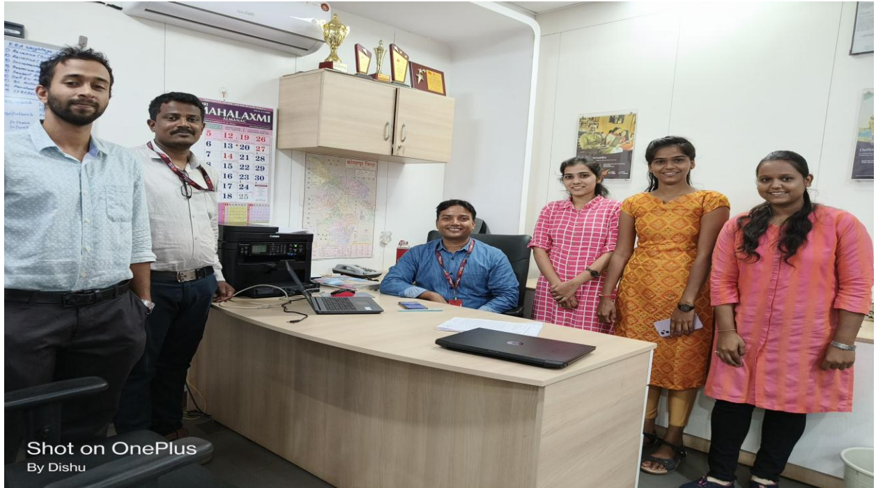
Shot on OnePlus By Dishu