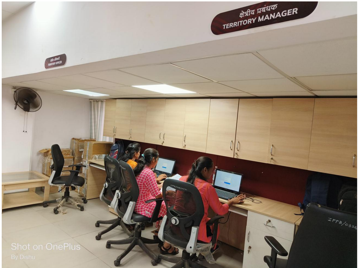
Shot on OnePlus By Dishu