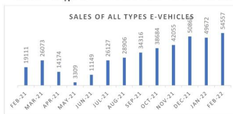
Chart No. 1: All types of E-Vehicles Sales in India- Feb 2021 to Feb 2022