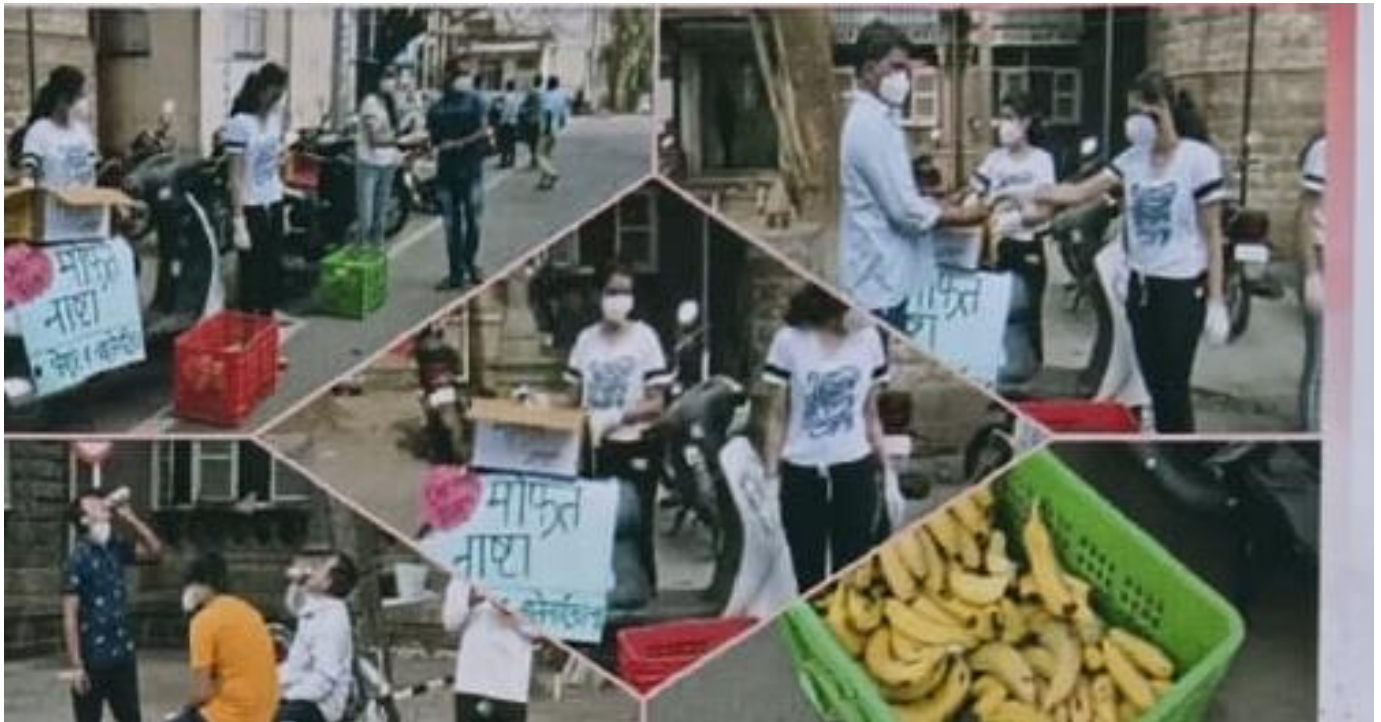
Students distributing Diwali supplies to those in need during the pandemic: pic.1