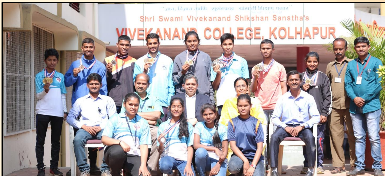
Sanstha Antargat Athletics Championsip VCK Team 2018-19