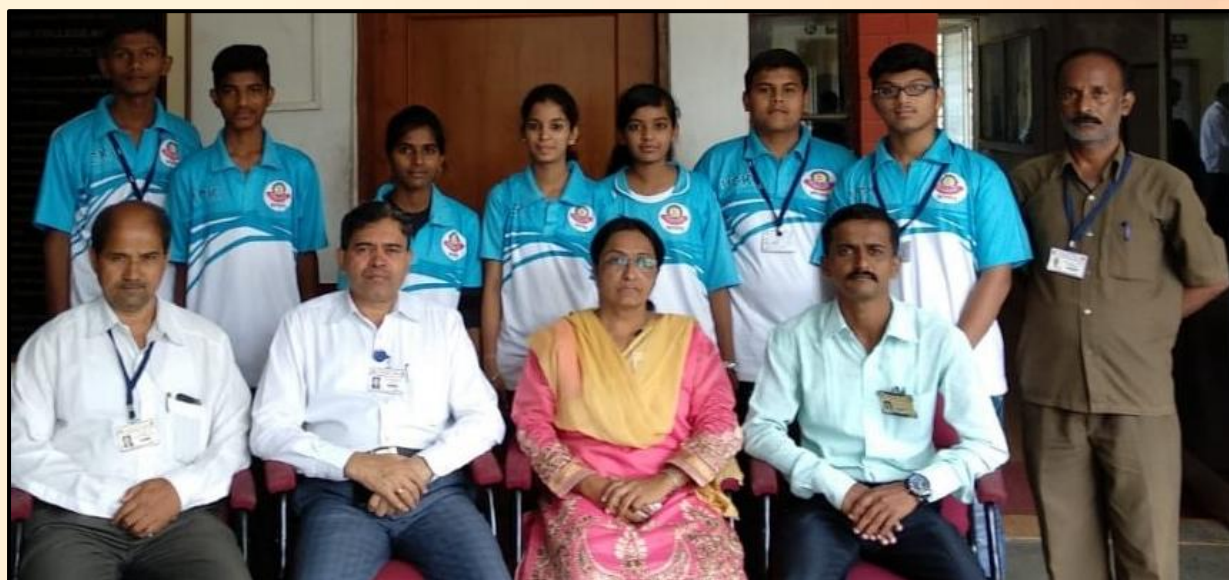
Under 19 Boy & Girls Carom VCK Team 2018-19