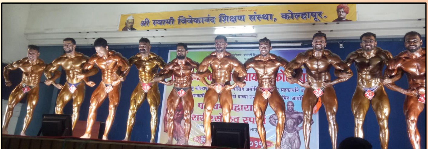
West Maharashtra Body Building Competition "Vivekanand Shri" organized by Vivekanand College, Kolhapur