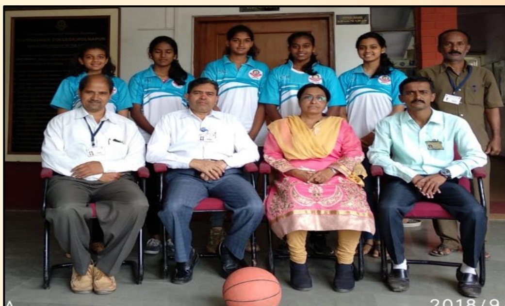
Under 19 Girls Basketball VCK Team 2018-19