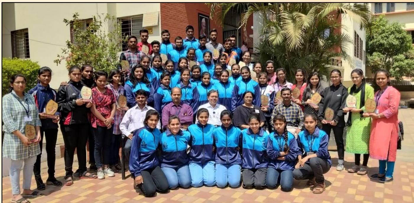
State & National Players on Annual Prize Distribution